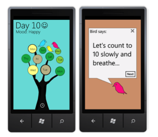
Fig. 1. EmoTree Mobile Phone Application. Main Page (A) and Intervention Page (B)

As usage continues, the user may assess overall progress or history by selecting the history icon at the bottom of the tree. Inspiration for the interface design came from the notion of tending a garden and using that as a metaphor to visually guide users to make better choices [1]. Since the application was designed for long-term use, the idea of a tree that gradually grows based on your daily health decisions served best as a visual guidance system that could invoke encouragement: the healthier your choices, the healthier the tree.