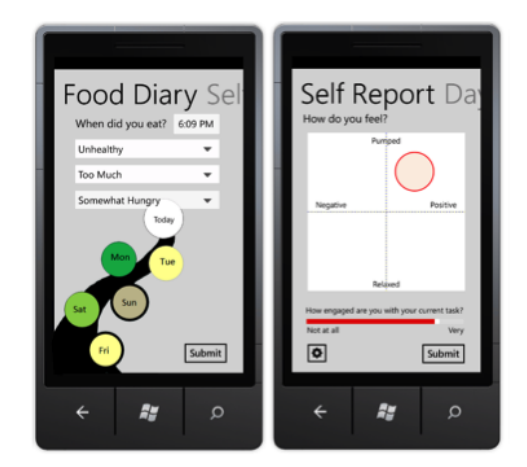
Fig. 2. EmoTree Mobile Phone Application. Nutrition Log \left(A\right) and Self-Report Tool \left(B\right)

In Study 1, we conducted a user study (N=12, 2 males) to investigate emotional eating patterns using EmoTree. In recruitment, all participants self-identified as emotional eaters.