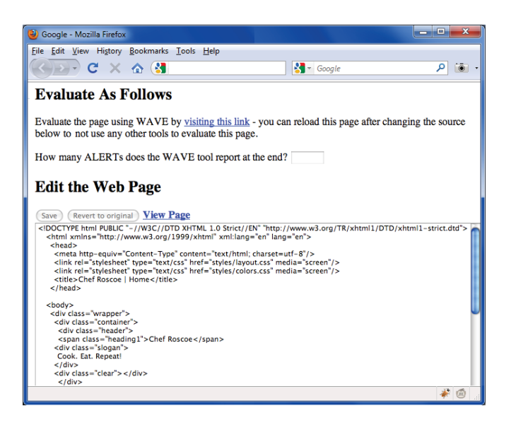
Figure 6: The web-based editor used by participants in the study.

appropriate improvements to the page using a web-based text editor that contained the web page source code (Figure 6). The participant could save the source of the page and view the rendered page in another window. Finally, participants were asked for a written description of the problems that they observed.