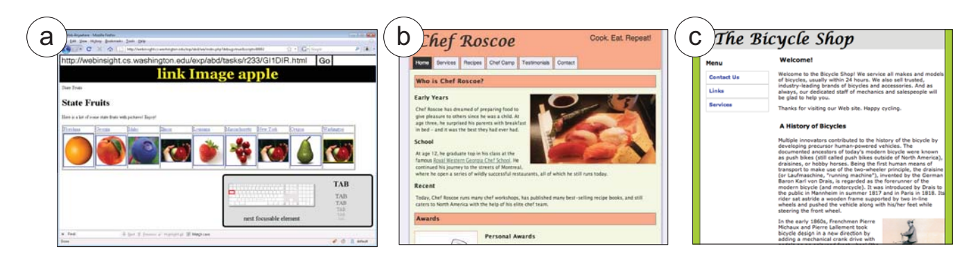
Figure 5: Pages exhibiting accessibility problems: (a) using tables for layout, which causes incorrect reading order, (b) improper use of heading tags, and (c) a combination of four accessibility problems.

order of the page. With the addition of advanced CSS techniques, how a page is rendered in a web browser may not reflect its DOM order. For instance, some WYSIWYG editors use absolute positioning to provide more flexibility. As a result, if a designer does not pay attention to the order they are inserting content, the rendered view can be vastly different than the reading order in the HTML source.