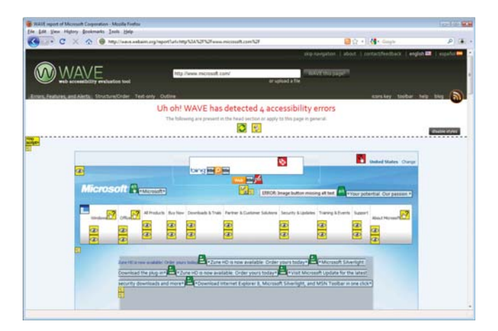
Figure 2: The WAVE accessibility evaluation tool's analysis of a web page showing numerous warnings, many of which are not actually problems.

The idea of recording and sharing user actions as parameterized URLs was inspired by the USA Track and Field's "Map it." On this web site, people can draw a running route on a map, save it to a centralized repository, and then share it with others as a parameterized URL [27]. Capturing all necessary information to replay a trace as a URL makes these recordings flexible and easy to share, and enables any-