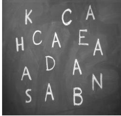
Figure 1: The Visual Counting Task. Subjects were asked to count the number of occurrences of the letter “A” on the current display screen.