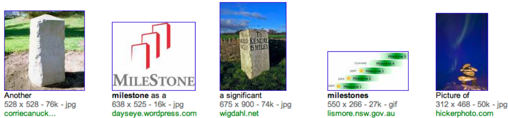
Figure: Image Search Result for "milestone" using images.google.com

The next task is to generate associated images of each event. We haven't fairly explored this area yet; so far we are only considering identifying the agents (subject) of the event and few related information like where it happened, what happened, etc. However, after finding out what to search for, finding the right image is challenge of its own! As an illustration, the following is the first five search results for word "milestone".