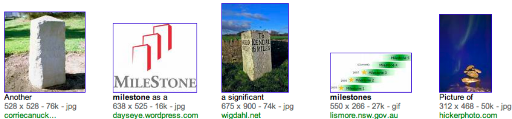
Figure: Image Search Result for "milestone" using images.google.com

The next task is to generate associated images of each event. We haven't fairly explored this area yet; so far we are only considering identifying the agents (subject) of the event and few related information like where it happened, what happened, etc. However, after finding out what to search for, finding the right image is challenge of its own! As an illustration, the following is the first five search results for word "milestone".