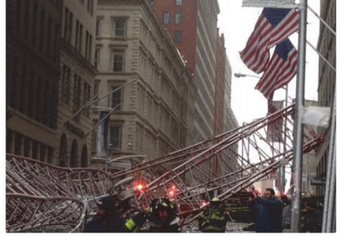
Figure 3: One of the two Firsthand Encounter tweets of the February 6, 2016 New York City crane collapse.

dispatches, could in principle have been augmented with a twitter post.