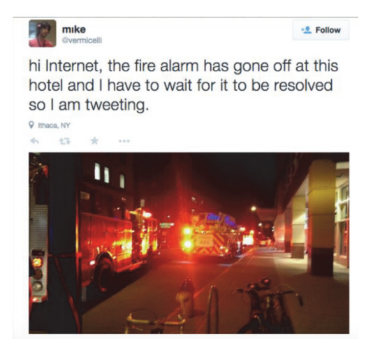
Figure 1: Example of a tweet categorized as Fire Alarm.

could see pictures and texts that would give them a sense of the size of the crowd they would encounter. Useful tweets would be ones sent during the early stages of the emergency event, rather than after all the emergency crews were at the scene. We wished to exclude tweets that originated from the emergency dispatch services themselves, as well as retweets of such official posts.