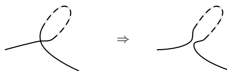
Fig. 2: Removing a self-intersection.

Since e was an even edge, the edges incident to v remain even. The pulling move will introduce self-intersections in curves that intersect e and are adjacent to v . Since drawings are typically defined not to have self-intersections, we remove them by using the move shown in Figure 2 (although we could preserve self-intersections and instead modify the analysis slightly).