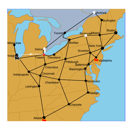
Figure 5: TRAINS-95 System Map Display after (4)

At first glance, this model seems quite similar to the expand-criticize cycle found in hierarchical planners since Sacerdoti (Sacerdoti 1977). The significant difference is in step (C). Rather than pursuing a least commitment strategy and incremental top-down refinement, we "leap" to a solution as soon as possible. You might call this a "look then leap" strategy rather than the traditional "wait and see" strategy used in leastcommitment planning. As such, our strategy shares similarities with Sussman's original work with an emphasis on plan debugging and repair (Sussman 1974). When the plan must be a result of a collaboration, it seems that it is more efficient to throw out a solution and criticize it, rather than to work abstractly as long as possible. Notice that this is exactly why committees often start with a "straw man" when trying to develop new policies. This helps the committee focus its discussion, just as the the plans under discussion in mixedinitiative planning provide part of the context within which the manager is exploring the problem.