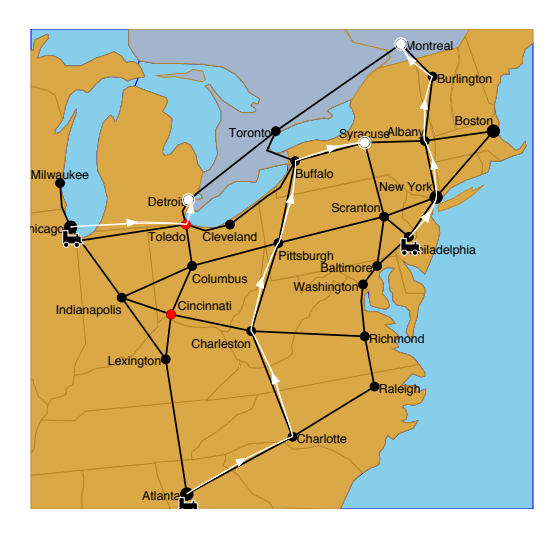
Figure 6: Final TRAINS-95 System Map Display