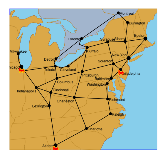
Figure 1: TRAINS-95 System Map Display

of language, we obtain a powerful unifying model of the interaction as a form of dialogue . Of course, multimodal communication raises a new set of issues for all aspects of the system, as we will discuss later.