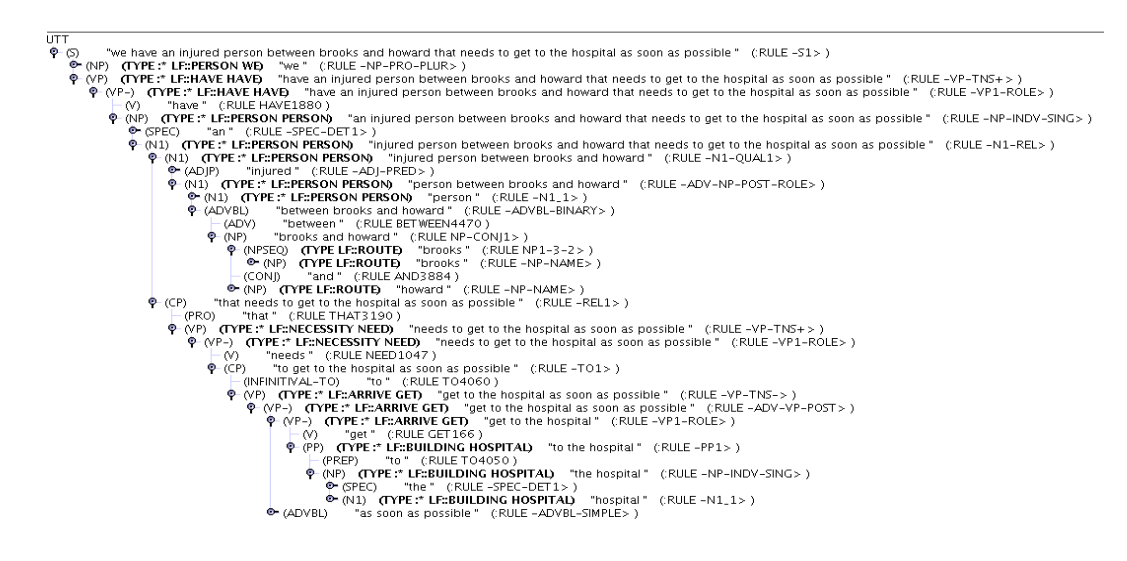
Figure 1: Sample parse tree for s16 utterance 297