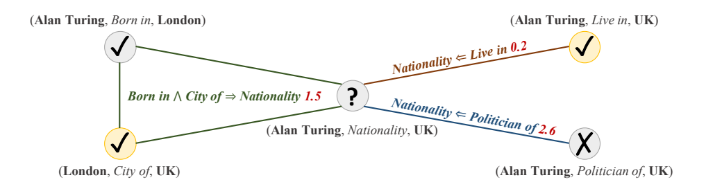
Figure 1: Framework overview. Each possible triplet is associated with a binary indicator (circles), indicating whether it is true ( \checkmark ) or not ( \varkappa ). The observed (yellow circles) and hidden (grey circles) indicators are connected by a set of logic rules, with each rule having a weight (red number). For the center triplet, the KGE model predicts its indicator through embeddings, while the logic rules consider the Markov blanket of the triplet (all connected triplets). If any indicator in the Markov blanket is hidden, we simply fill it with the prediction from the KGE model. In the E-step , we use the logic rules to predict the center indicator, and treat it as extra training data for the KGE model. In the M-step , we annotate all hidden indicators with the KGE model, and then update the weights of rules.