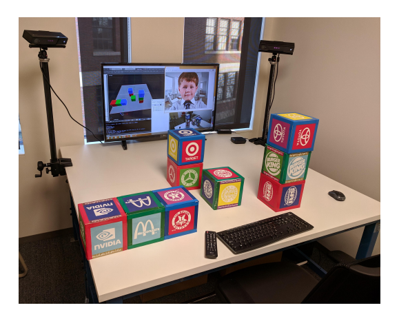
Figure 1: The blocks world apparatus setup.

Eta is a dialogue manager (DM) designed to follow a modifiable dialogue schema, specified using