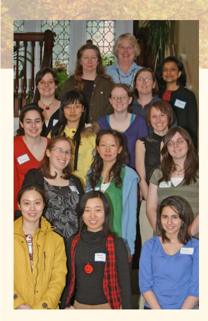
April 4 Ladies Tea at AAUW House

As for what career to choose, I believe in studying what you really like, independently of whether the area has a future or what other people think of the area. One has to live with that decision for so long that it is important to follow ones dreams.