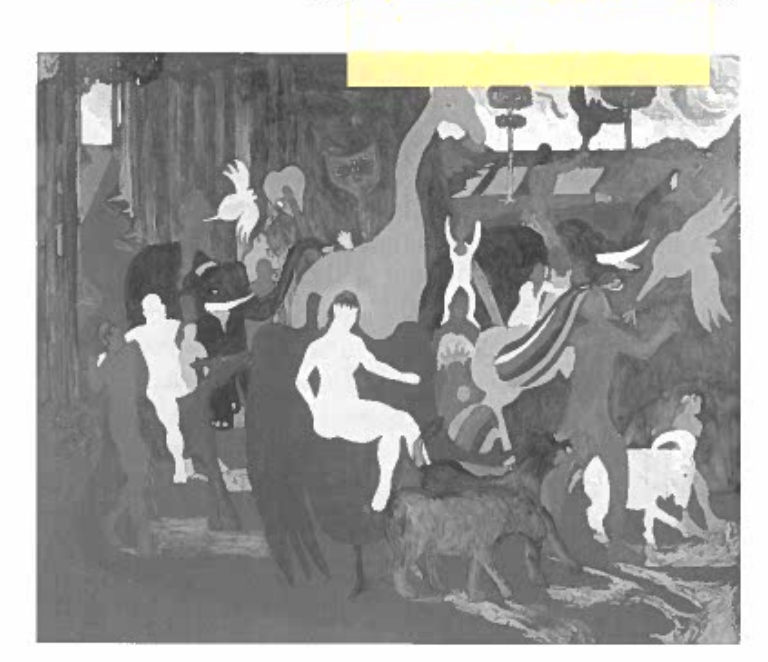
Figure 3.3 Bob Thompson, Triumph of Bacchus , 1964

The dust jacket of this book shows a painting by Bob Thompson (figure 3.3), an American artist from the 1960s who liked to paint scenes containing human forms in classical poses, but filled with monochromatic splashes of color instead of normal features. Colors would be repeated, so that two of the figures might be filled with the same bold yellow, while three others were filled with red. If a robot looked at this painting, it would see not just colors, but colors with a particular shape. If asked to comment on how it knew that shapes A and C were yellow whereas shapes B and D were red, it can only answer that shapes A and C are filled